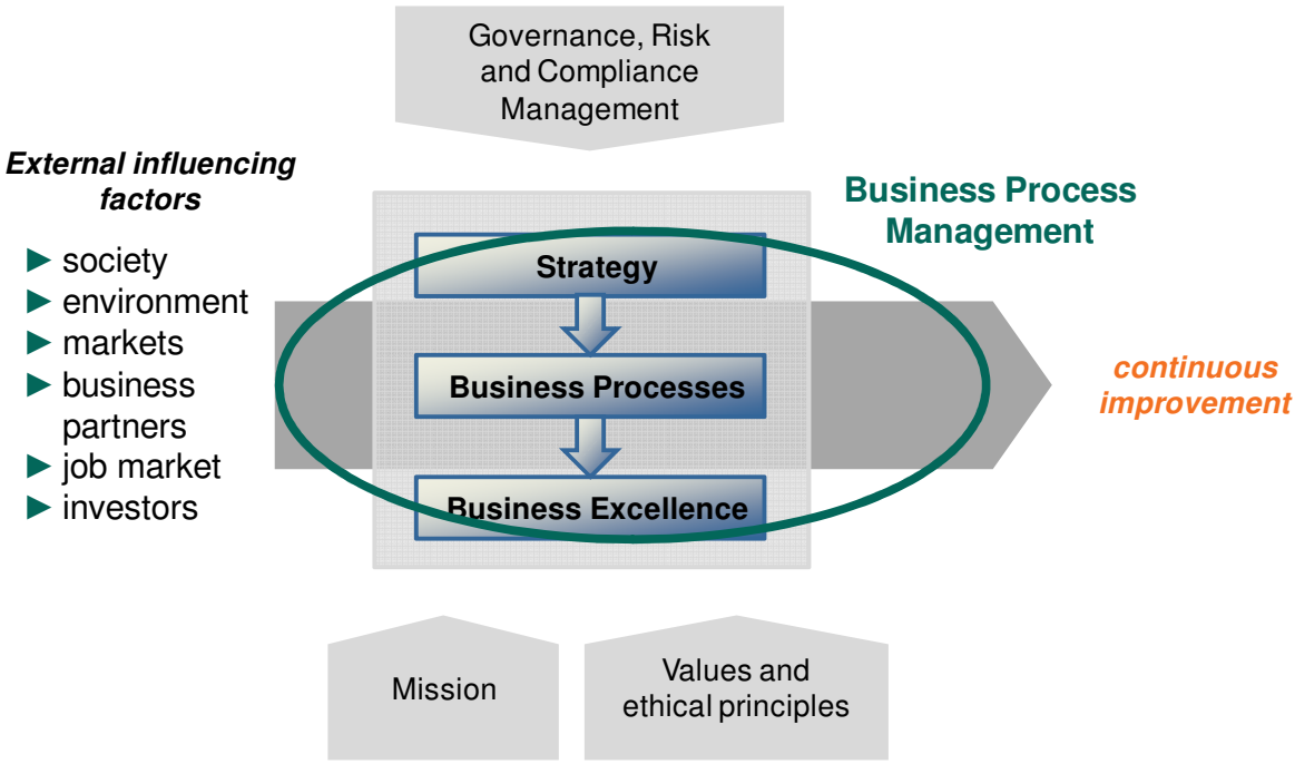
Alignment of business processes to the strategy

As one of the pioneers of business process management PROMATIS is active since the early nineties, designing and implementing integrated business solutions. And with today's technologies, it is possible to bring agility into business: The business itself now becomes active and drives the implementation of strategies into effective business processes. The dangerous clashes between strategy and process are past history - Business Excellence is the result! The IT architecture provides a solid framework and business rules for standardizing and supports access to enterprise applications with seamlessly integrable Web services. Agile Business Process Management is what we call this solution. And it fits for companies, unions, foundations, associations and public administration alike.